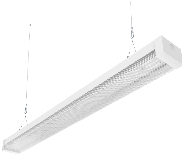
RU LED 4WRP | Suspended Mounted