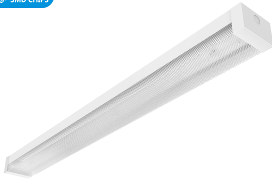
RU LED 4WRP | Surface Mounted