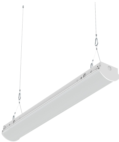
RU LED 3ST | Suspended Mounted