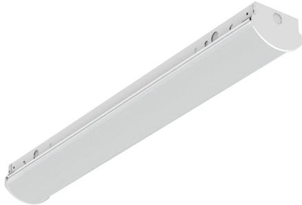
RU LED 3ST | Surface Mounted