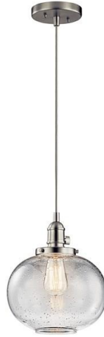
RP 3852 BN | ONE LIGHT PENDANT