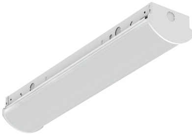
RU LED 2ST | Surface Mounted