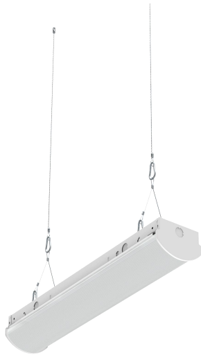
RU LED 2ST | Suspended Mounted