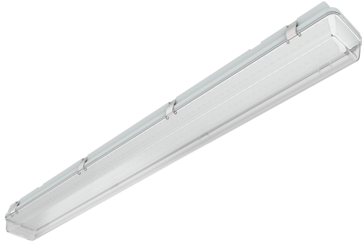
RU LED 4VPR | Surface Mounted