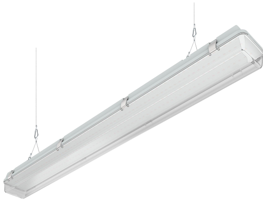
RU LED 4VPR | Suspended Mounted