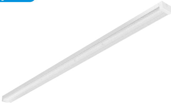
RU LED 8WRP | Surface Mounted