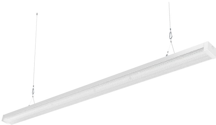
RU LED 8WRP | Suspended Mounted