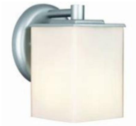
RO9841 | LED OUTDOOR WALL SCONCE