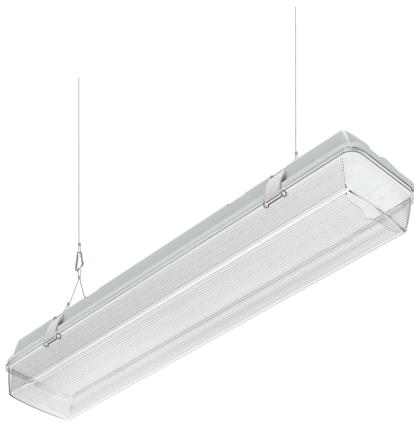
RU LED 2VPR | Suspended Mounted