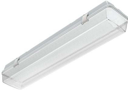
RU LED 2VPR | Surface Mounted