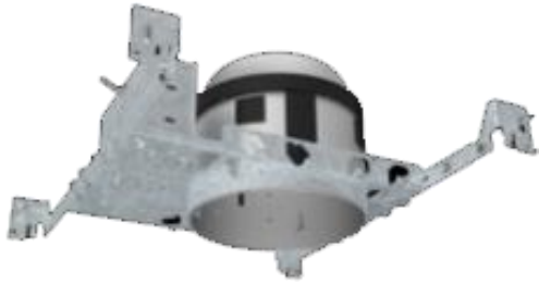
RRC6-SIA | New construction