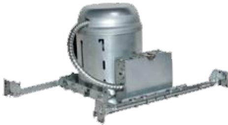
RRC6 | New construction