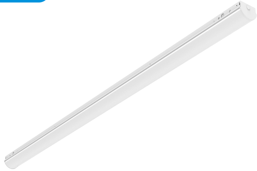
RU LED 8ST | Surface Mounted