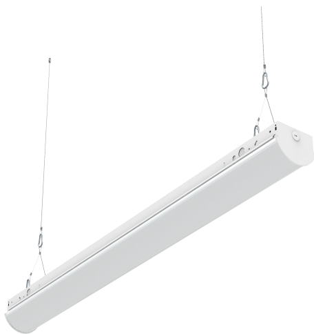
RU LED 4ST | Suspended Mounted