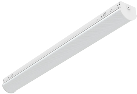
RU LED 4ST | Surface Mounted